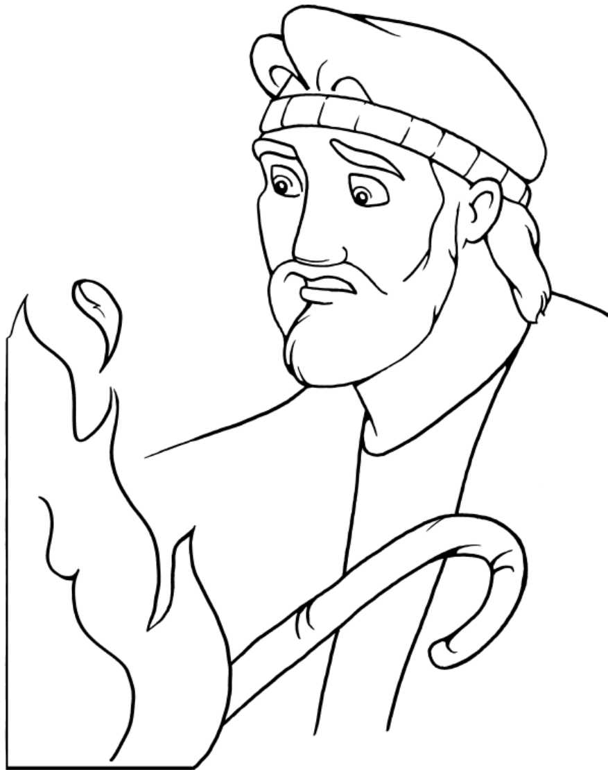
Moses and the Burning Bush