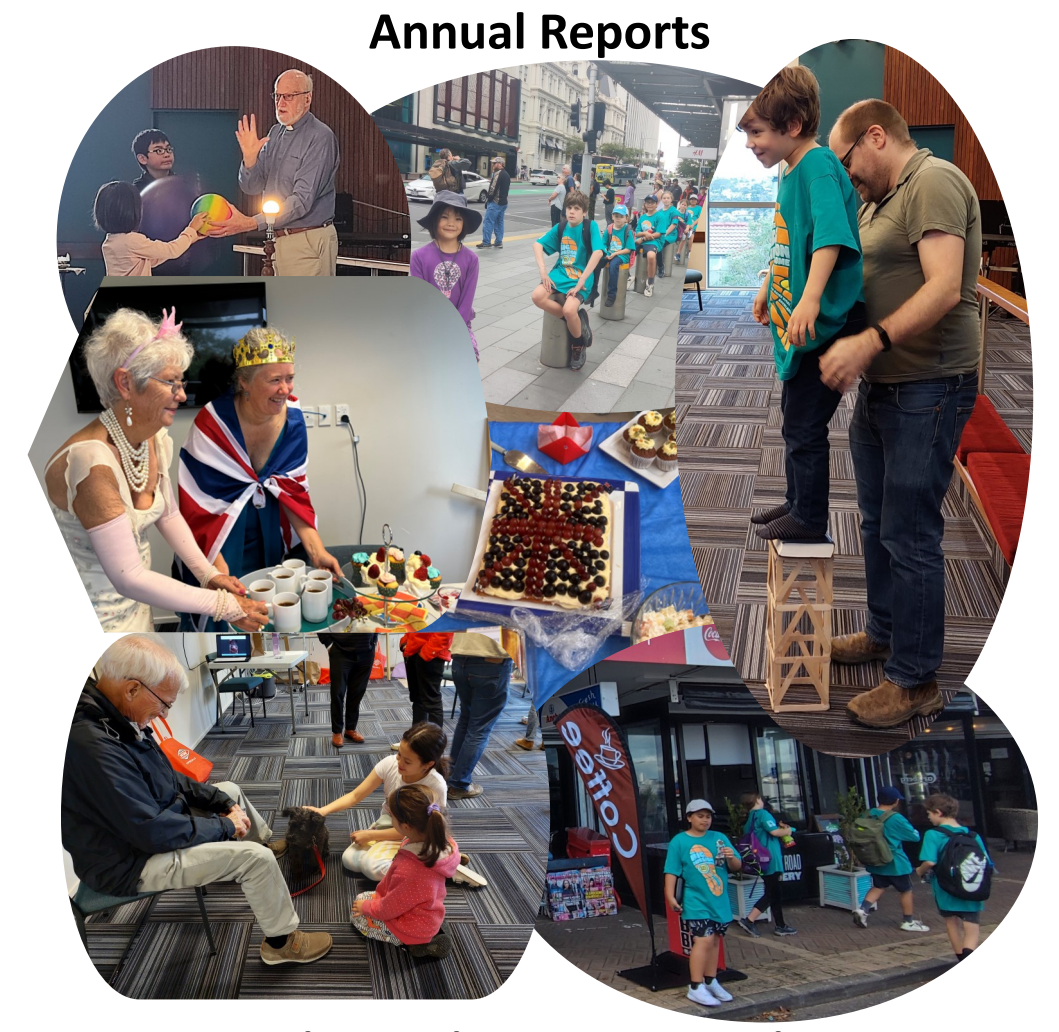
Annual General Meeting 17 March 2024